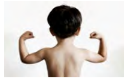
The 1st Monday in October is Child Health Day