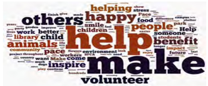
The 4th Saturday in October is Make a Difference Day What will you do to make a difference in your community?