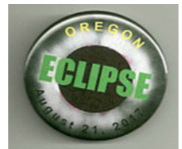
Monday, August 21, 2017, Path of Totality