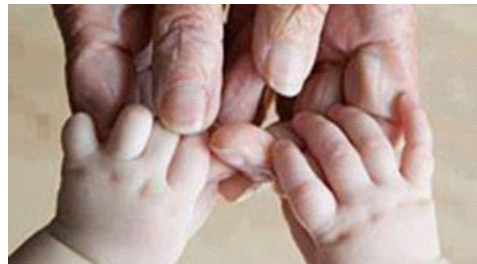
Sunday, August 20, 2017, is National Senior Citizen's Day