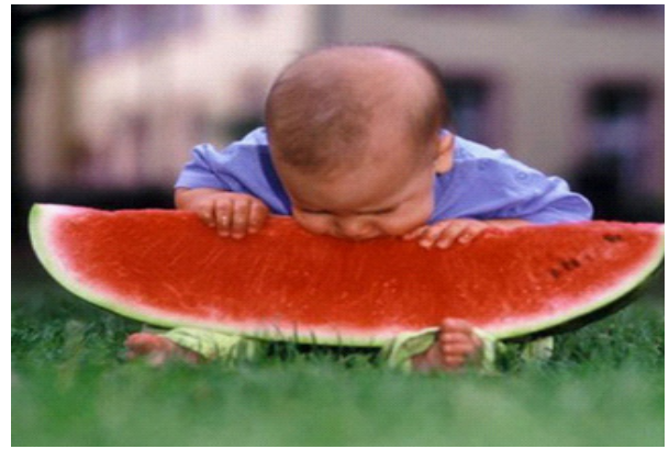
Thursday, August 3, 2017, is National Watermelon Day