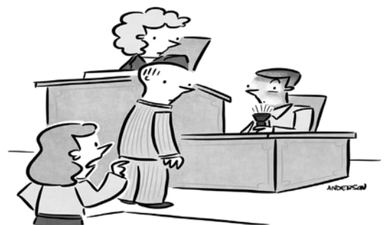
"Objection! Witness is holding a flashlight under his face and speaking in a spooky fashion."