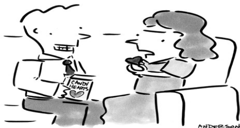
"What's all this fine print under 'Be Mine?'"